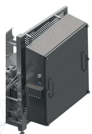
Version with buffer chute