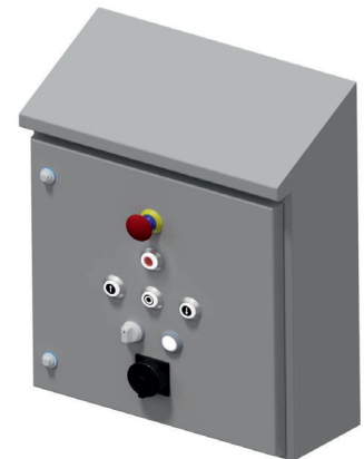
Optional: control cabinet in hygienic design