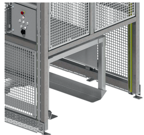
Optional: Entry area monitored with Safety light grid monitored

Illustrations may differ! Technical changes and errors excepted.