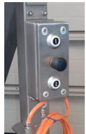
Control panel optionally in stainless steel also available in HD version

Abbildungen können abweichen! Technische Änderungen und Irrtümer vorbehalten.