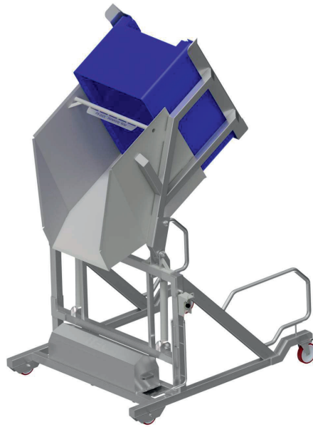
Swingloader SL- 1000