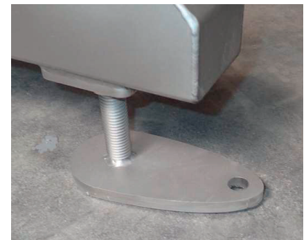
Standard version with Height adjustable feet