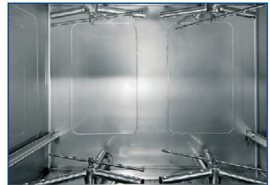
No corners, extremely hygienic